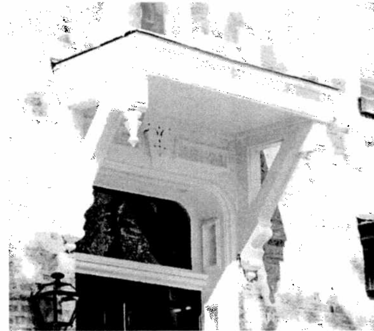
Above: The entrance to 2106 N. Fremont has a wooden pent roof with carved wood brackets. Left: 2106 has a front stoop with wooden steps and cast-iron railings leading to a wooden double door set within a round-arched frame with transom.